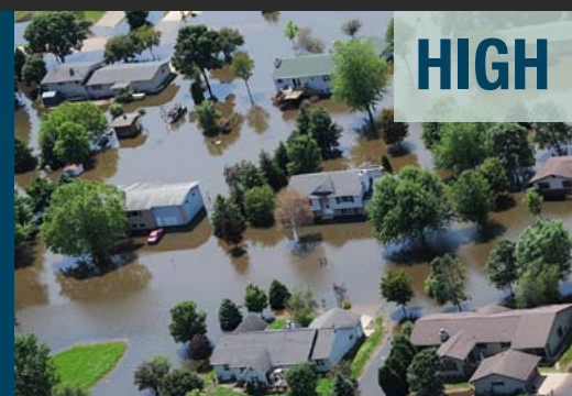
Spring Green, WI